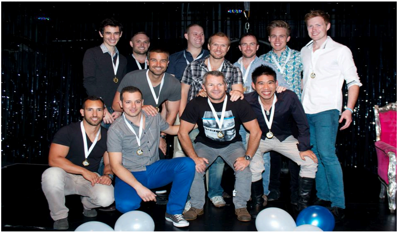
Above: Awards Night 2013 - Sydney Rangers B Team