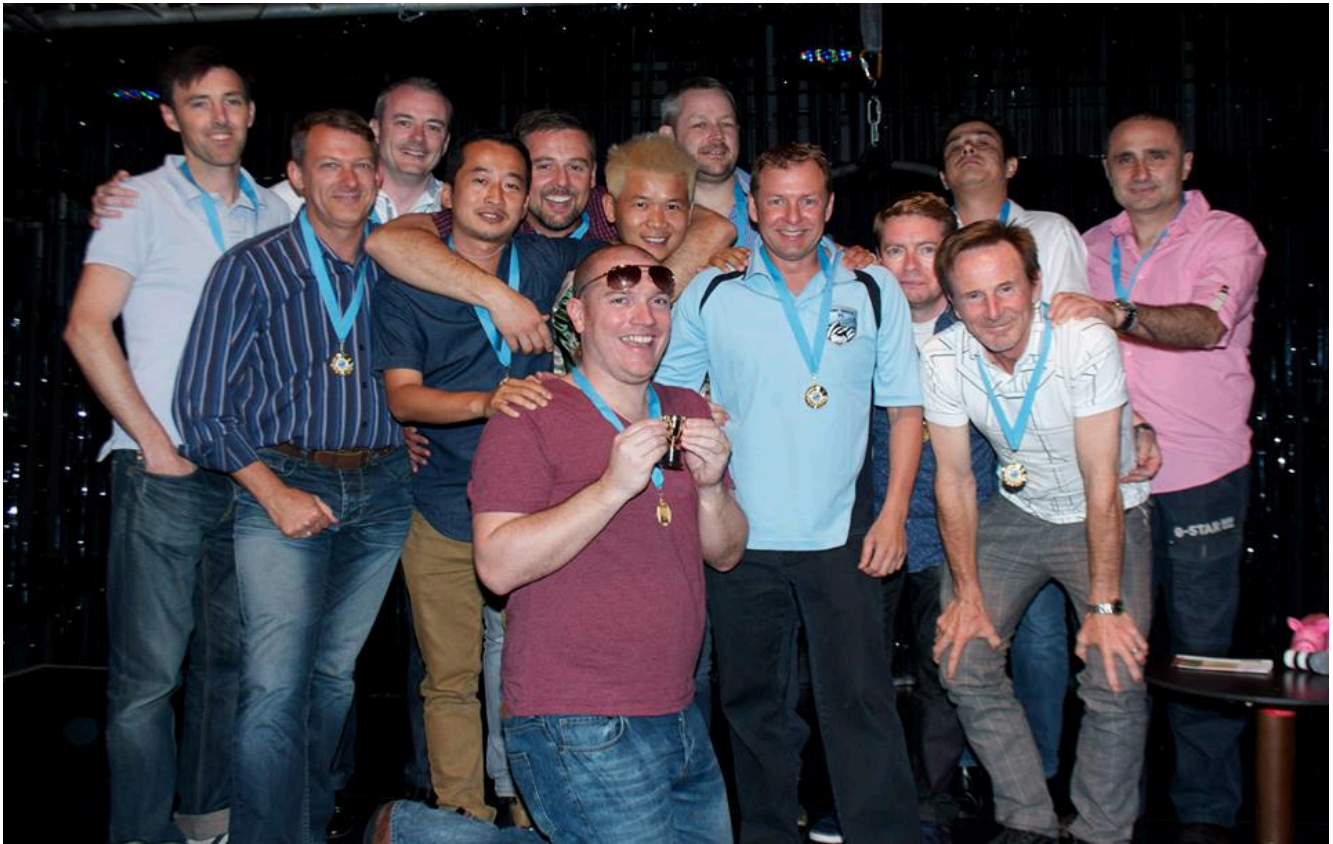
Above: Awards Night 2013 - Sydney Rangers Over 35's Team