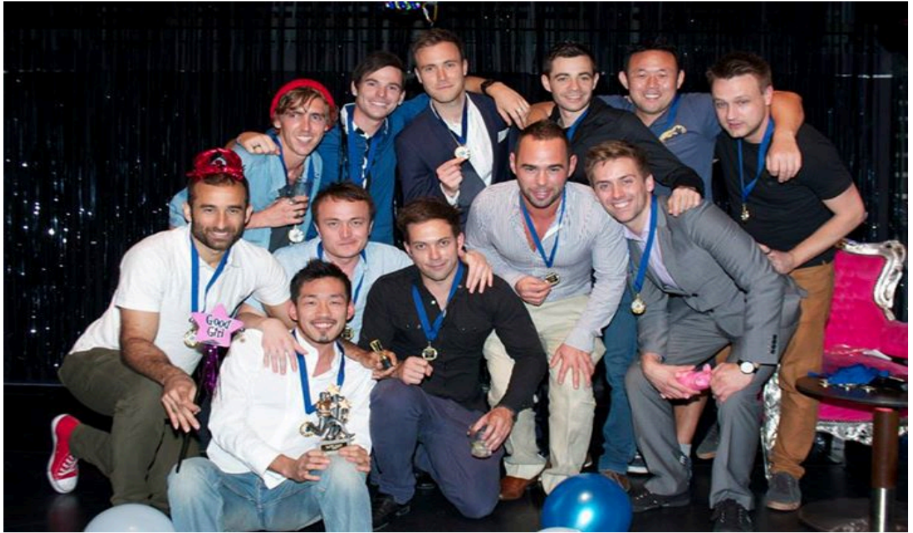
Above: Awards Night 2013 - Sydney Rangers A Team